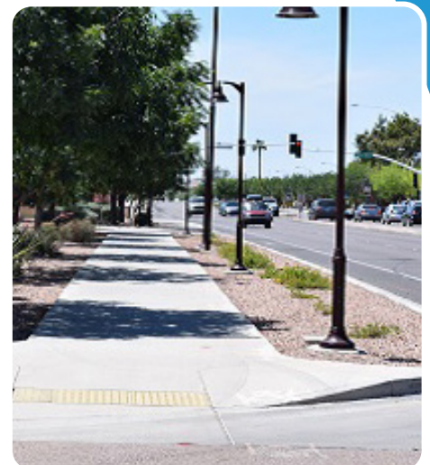
Examples of potential SR2T improvements such as enhanced pedestrian crossings and improved sidewalk connections